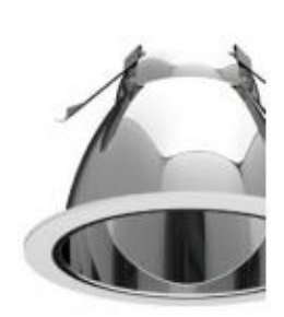
B6022 6" Cone Reflector Trim Lamp: A19 LED E26 12W Max.