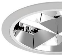
RC614 6 inch Horizontal Cross Blade White Ring