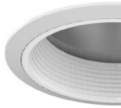
RC611 6 inch Horizontal Reflector with Baffle White Ring