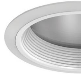
RC613 6 inch Horizontal Baffle with Regressed Lens White Ring