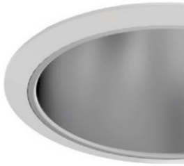
RH6002 6 inch Horizontal Reflector Self Flanged/White Ring