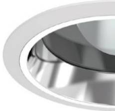
RC612 6 inch Horizontal Reflector with Regressed Lens Self Flanged/White Ring