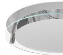
RCH166 6 inch Horizontal Reflector with Drop Glass Self Flanged