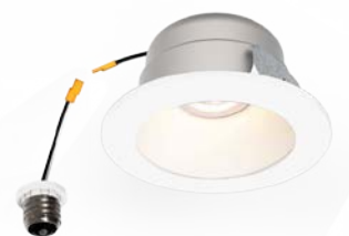
Shown With White Light Engine, Round Reflector And Round Trim