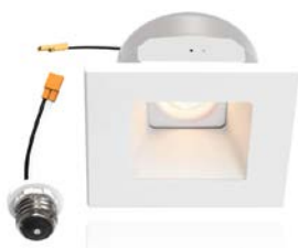
Shown With White Light Engine, Square Reflector And Square Trim