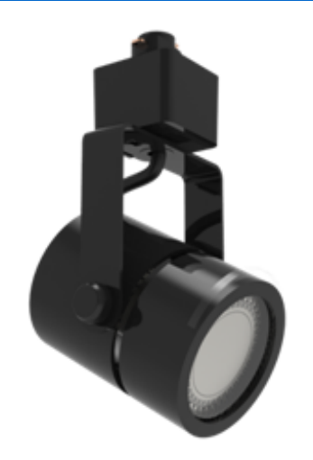
Line Voltage Mini Cylinder Track Head