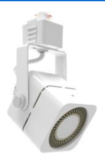
Line Voltage Square Track Head