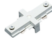
K608 Mini Coupling Finish: WH/BK