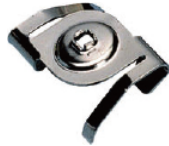
K604 T-bar Attachment Clips For T-bar Drop Ceiling Finish: WH/BK/SN