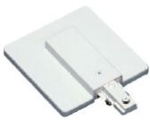
K606 Single/Two Circuit Live End With Box Cover Finish: WH/BK