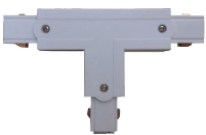
K609 Single/Two Circuit T-Connector Finish: WH/BK