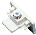
K607 Track End Cap Finish: WH/BK