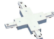
K611 Single/Two Circuit X-Connector Finish: WH/BK